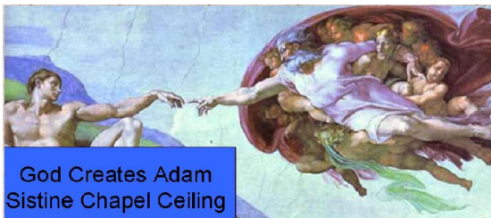
God Creates Adam Sistine Chapel Ceiling

Exodus 20:11—God says in the ten commandments, “for in six days the Lord made the heavens and the earth, the seas and all that is in them. . .”